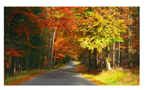
HAPPY FALL The first day of fall is Wednesday, September 22.