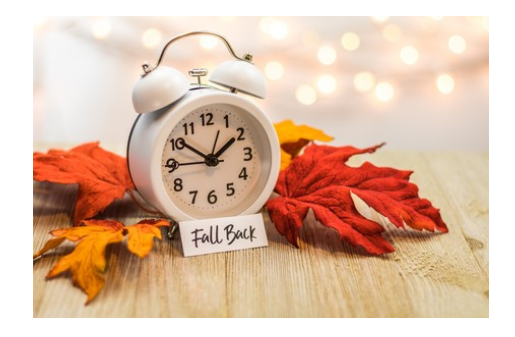
DAYLIGHT SAVING TIME ENDS Don't forget to turn your clocks back one hour on November 3rd.

Tampa's Downtown Market is November 14th, 12:00 pm - 4:30 pm, on the Franklin Street Esplanade. Discover a hidden oasis of farm-fresh goodness, right in the heart of the Downtown Core.